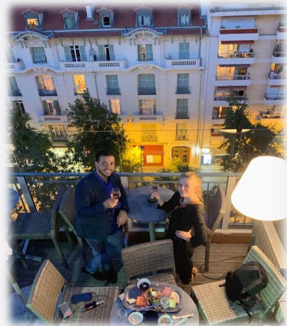
Hotel Monsigny rooftop

Our first event was on Saturday. We invited you to climb with us to the rooftop of Hotel Monsigny and meet trainees from all over Europe, at the top of Nice. One hundred of you took up our invitation, and we are very glad you did. Despite increasing the maximum capacity, we once again were fully booked. It is fantastic to see the willingness of trainees from all over the continent to participate, and we hope to be working in the future to make the social event accessible to as many of you as possible.