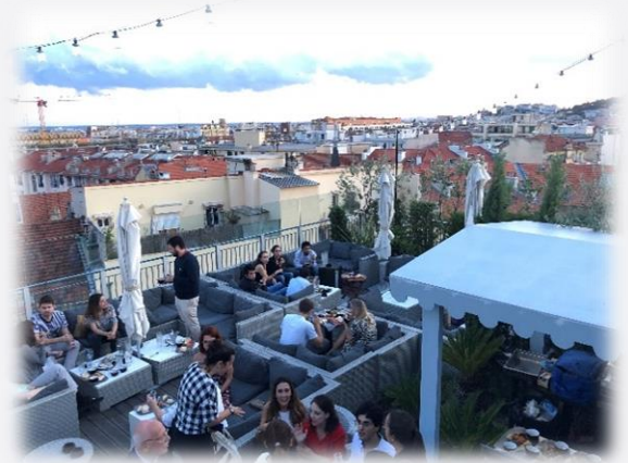
On the rooftop!