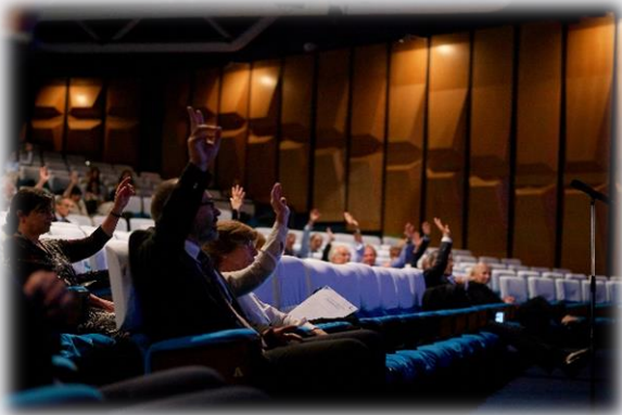
Voting during General Assembly