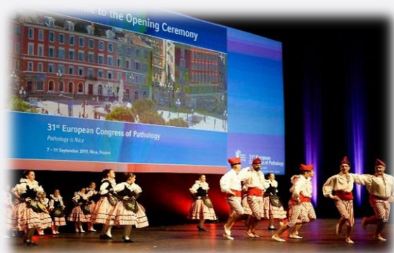
Opening Ceremony - Ciamada Nissarda

The Social programme was great with a lovely Opening Ceremony showing a dance performance made by local dancers and the folk dancing Ciamada Nissarda, and with a classic concert which took place in the oldest church of the city, the Cathedral Sainte-Reparate located downtown.